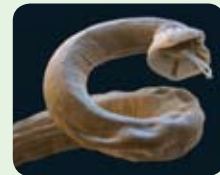
Adult A. vasorum lungworm These live in the heart and pulmonary arteries

Angiostrongylus vasorum can cause a wide range of symptoms – some severe, including coughing, lethargy, fits and blood clotting problems. However other pets may show no obvious signs of problems.